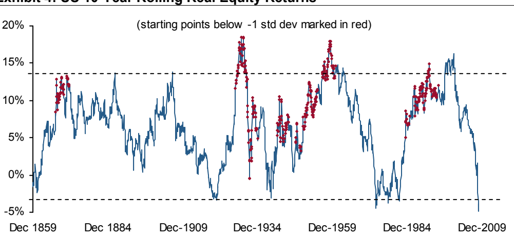
Exhibit 4: US 10-Year Rolling Real Equity Returns

And yet, for that to happen, governments themselves must remain creditworthy. If they do, the current crisis – severe as it is – should in the end lay the foundation for a greener global economy and a more sustainable prosperity.