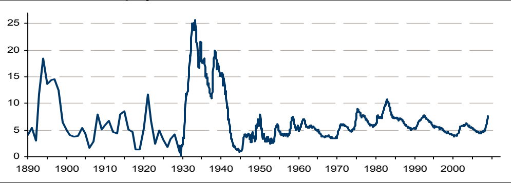
Exhibit 1: US unemployment rate from 1890 to 2009

Spare production capacity soared in this period to a level nearly twice as high as in 1982 and 2001. Behaviorally and psychologically, therefore, the current crisis already felt like a depression by early 2009, with "falling prices, restriction of credit, low output and investment, numerous bankruptcies" and sharply rising unemployment.